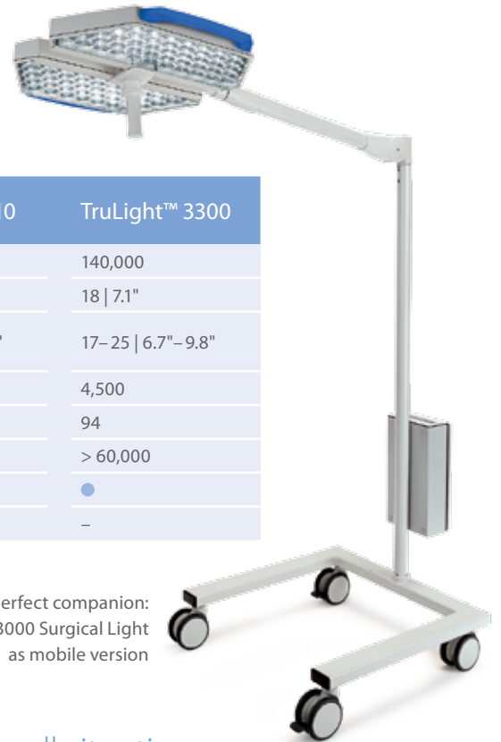
The perfect companion: TruLight™ 3000 Surgical Light as mobile version