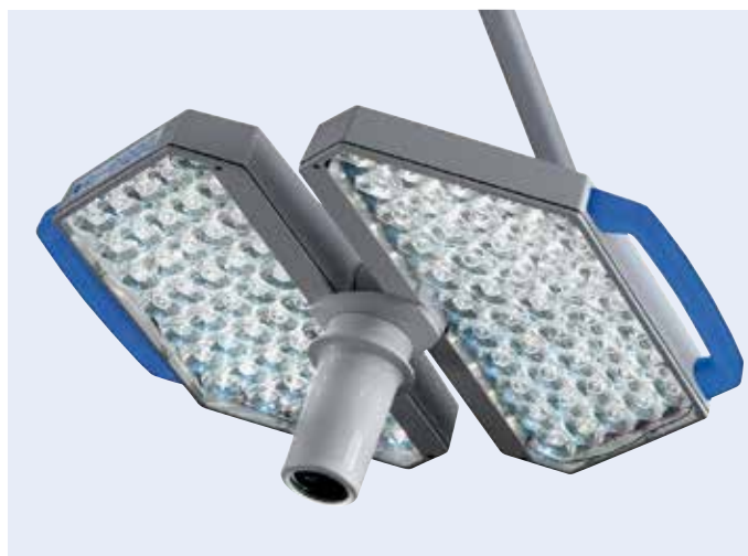
Optional integration: the innovative TruVidia™ Camera System for documentation, teaching and research

When time is of the essence, you can rely on the TruLight™ 3000 Surgical Light. Simple to use and lightweight, the light can be easily positioned and adapted to meet the requirements of the procedure/operation. As a ceiling-mounted, wall-mounted or mobile solution, the TruLight™ 3000 Surgical Light is able to accommodate any situation.