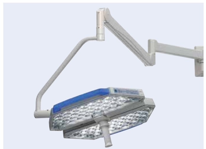
Wall-mounted version of the TruLight™ 3000 Surgical Light

As an efficient Surgical Light, TruLight™ 3000 bridges the gap between uncompromising light output and cost-effectiveness, providing clear added value over older lighting technologies such as halogen or gas discharge/high-intensity discharge (HID). The energy efficiency and durability of the LED light heads also make the TruLight™ 3000 Surgical Light more environmentally friendly.