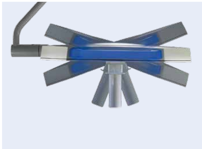
Easy to move and position, thanks to the lightweight light head

Values are subject to a general industry tolerance of ±5%